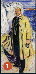
1 CHRISTIAN GIERLØFF 1909