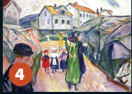
4 STREET IN KRAGERØ 1913