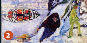
2 UPHILL WITH A SLEDGE 1910-12