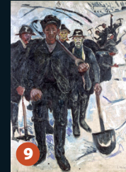
9 WORKERS IN SNOW 1910