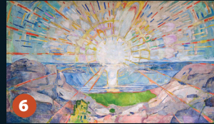
6 THE SUN 1911