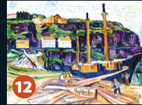
12 SHIP BEING SCRAPPED 1909