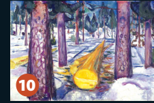
10 THE YELLOW LOG 1912