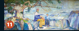
11 THE HISTORY 1911 / 1914-16