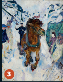
3 GALLOPING HORSE 1910-12