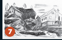
7 HOUSES IN KRAGERØ 1916